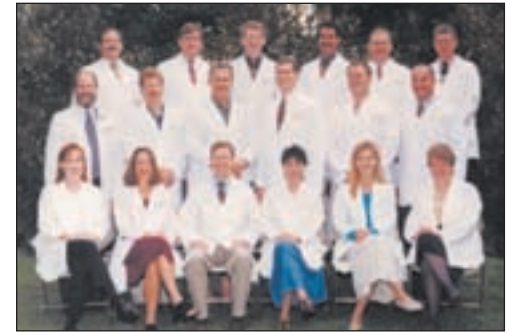
Original Physicians and Nurse Practitioners

2001 Patients First purchased ground in the heart of Washington – the site of the former Zero Manufacturing plant. The physician group then broke ground in November, 2001, for a new technologically advanced medical facility to centralize the rapidly expanding multi-specialty medical group.