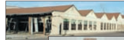
Zero Manufacturing along Duncan Avenue