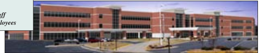
Expanded Washington, Mo., campus. Anticipated completion July, 2009.

What began as a small medical group in 1998 has grown to what is now a group of 60 physicians representing 15 healthcare disciplines. A network of 15 primary medical care clinics serve a patient population of more than 150,000 within a six-county area. The latest diagnostic tools and therapies are used at the Washington campus to provide convenient patient care, all under one roof... and close to home.